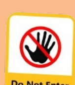
Do Not Enter