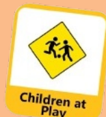
Children at Play