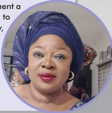
Odunsi Regina Environment Development, Calabar Port

T hese are my health concerns, poor safety culture among port users, inadequate health & safety signage within the port, and rusty water supply in conveniences and canteen.