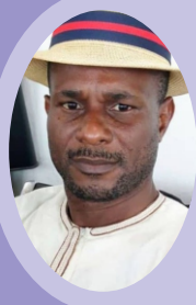
Obed Ocheme ICT, Lagos Ports Complex

T he Koko-led management can sustain and improve using various strategies.