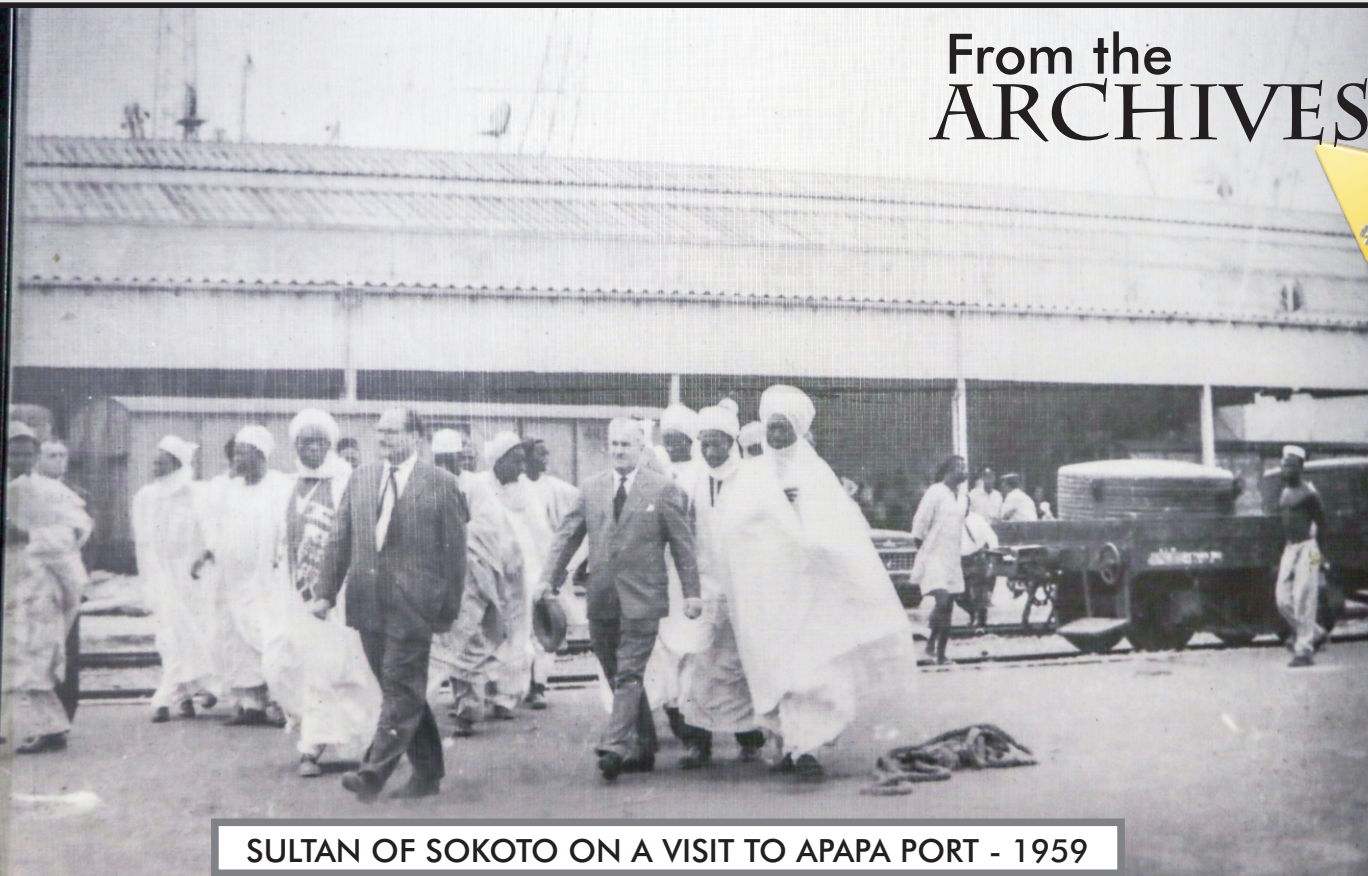
SULTAN OF SOKOTO ON A VISIT TO APAPA PORT - 1959

A production of the Corporate and Strategic Communications Division Available on www.nigerianports.gov.ng and in emails of all officers/staff of NPA.