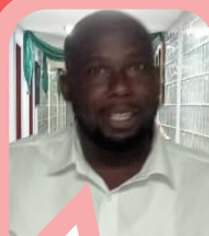
EKPO S.E Harbour, LPC

My Feeling on this is that it's a day to let those around you know you mean well to them, either male or Female. This can be expressed by giving out gifts or a lunch anytime with colleague. Be happy and affectionate on that day.