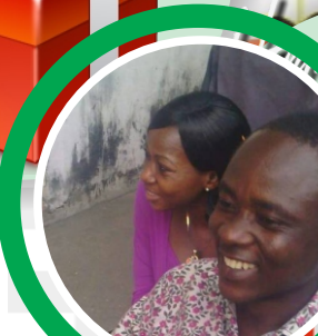
Dashe David Engineering, HQ 12th February