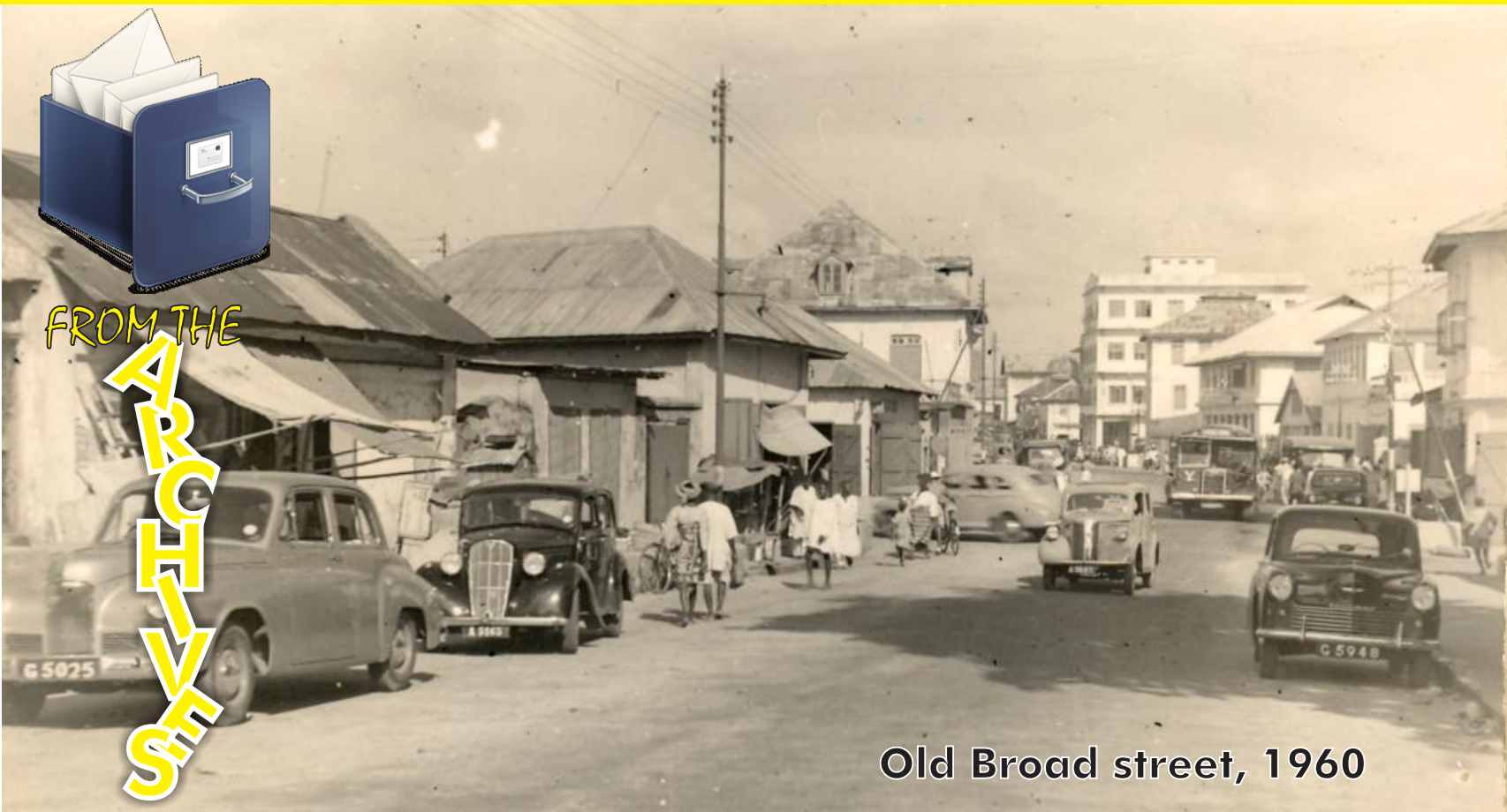
Old Broad street, 1960