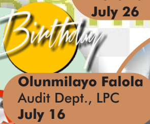
Olunmilayo Falola Audit Dept., LPC July 16