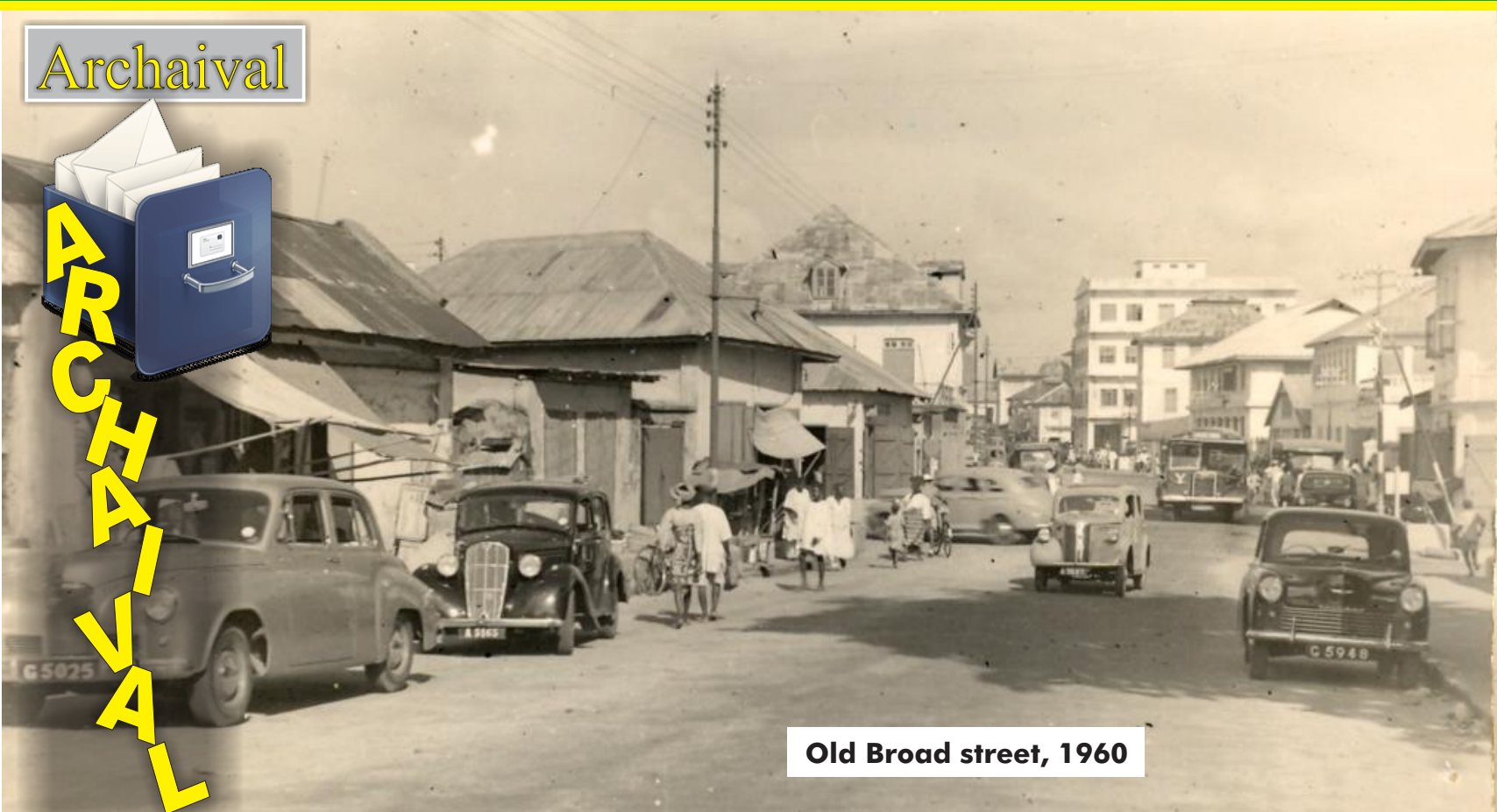
Old Broad street, 1960