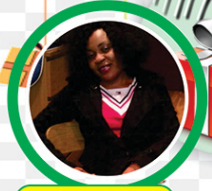
Godsglory Library HQ, Marina - Lagos. 2nd December