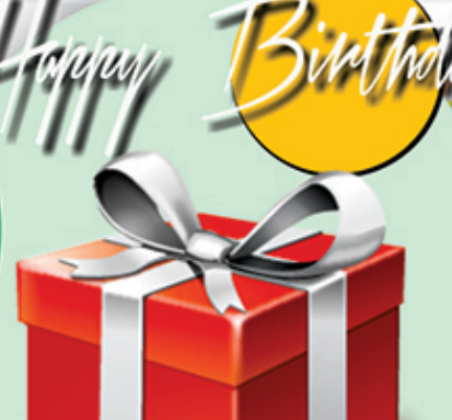
Olubiye Omidiji C & SC Division HQ. 17th December