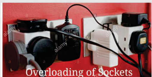
Overloading of Sockets