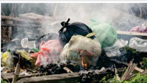
Burning of Refuse