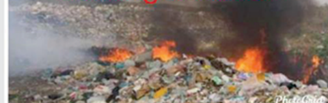
Avoid burning of your refuse at home