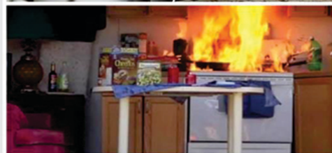
Pay attention to cooking in your kitchen