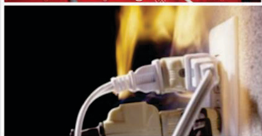
Don't overload electrical socket