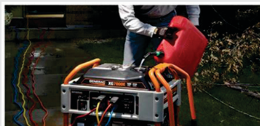
Refuelling of working Generator