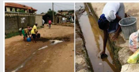
Scooping of Fuel