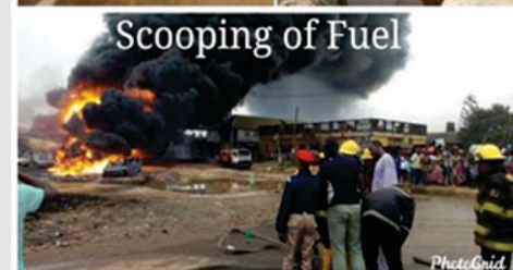
Never involve in scooping of fuel especially from fallen tanker