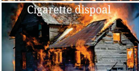
Don't dispose off cigarette stub carelessly