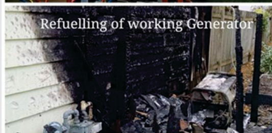
Don't refuel a working generator