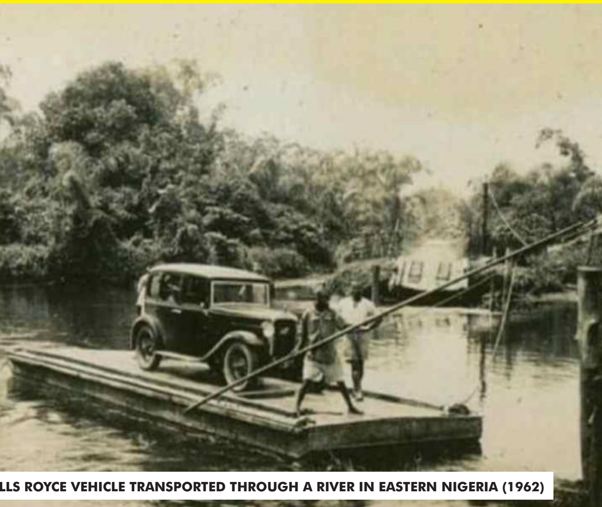
ROLLS ROYCE VEHICLE TRANSPORTED THROUGH A RIVER IN EASTERN NIGERIA (1962)