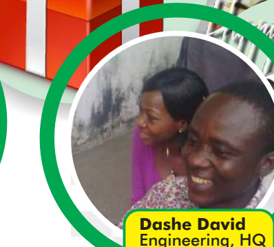
Dashe David Engineering, HQ 12th February