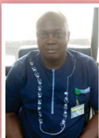
Ucheme Bensamin Servicom Dept. HQ Marina

I t depends on the tribe, the Yoruba's pay bride price before the ceremony. The Igbos during the ceremony just like most other tribes of the Country. However my take is that it should happen during the traditional marriage. It is the high point of the ceremony. It is part of critical symbols for the reason to celebrate.