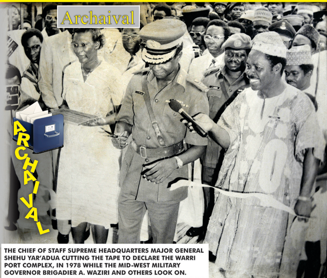
THE CHIEF OF STAFF SUPREME HEADQUARTERS MAJOR GENERAL SHEHU YAR'ADUA CUTTING THE TAPE TO DECLARE THE WARRI PORT COMPLEX, IN 1978 WHILE THE MID-WEST MILITARY GOVERNOR BRIGADIER A. WAZIRI AND OTHERS LOOK ON.