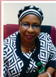
W. O. Osikoya Environment Dept. HQ Marina

I respective of the modern day civilization, bride price should never be abolished or scrapped prior to marriage ceremonies because bride price is cultural, customary and Biblical to us as Africans.