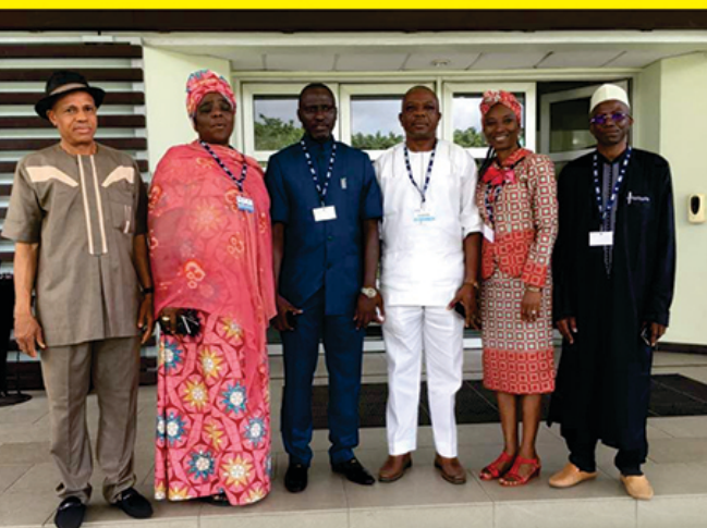
N igerian Ports Authority, Port Managers at Lagos Business School (LBS) on the 16th & 17th Nov. 2017 for a workshop on Port Performance.