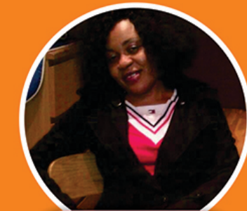
Godsglory 3rd December Library HQ, Marina - Lagos.