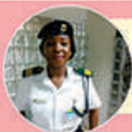
Mercy Park Security Unit

I would prefer my mother to stay after child birth because I am closer and more comfortable with my mum. I also relate better with her and have little or no reservations when asking for help or assistance.