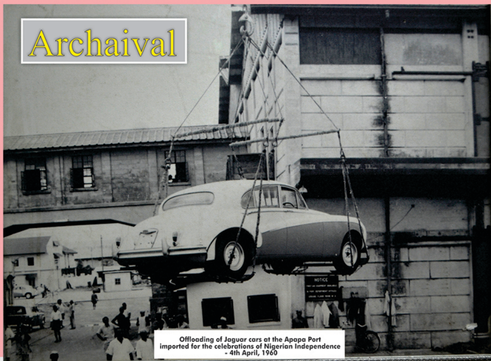
Offloading of Jaguar cars at the Apapa Port imported for the celebrations of Nigerian Independence - 4th April, 1960