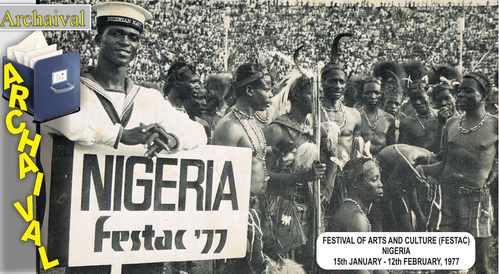
FESTIVAL OF ARTS AND CULTURE (FESTAC) NIGERIA 15th JANUARY - 12th FEBRUARY, 1977