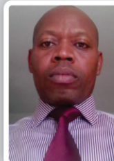
ZWALPON SALE FIRE SERVICE, LPC

I am indifferent to the above statement as letting go depends on the situation and circumstances. I equally agree to some extent, but it cannot be completely erased from one's mind but simply just to allow peace to reign.