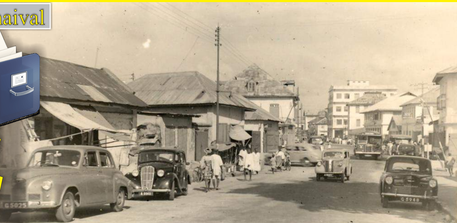
Old Broad street, Lagos, 1960